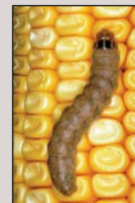
Western Bean Cutworm