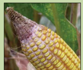
Gibberella Ear Rot