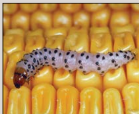
Southwestern Corn Borer