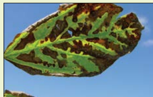
Brown Stem Rot