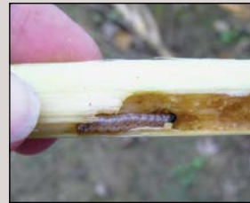
European Corn Borer