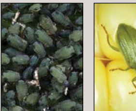
Corn Leaf Aphids