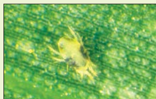
Two-Spotted Spider Mite