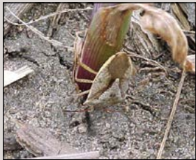
Brown Stink Bug