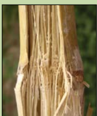
Fusarium Stalk Rot