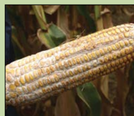
Diplodia Ear Rot