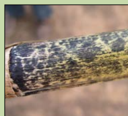
Anthracnose Stalk Rot