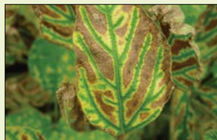
Sudden Death Syndrome