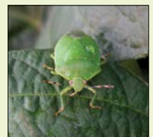
Green Stink Bug