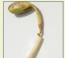
Pythium Root Rot