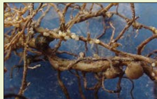
Soybean Cyst Nematode