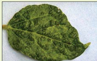
Bean Pod Mottle