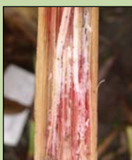
Gibberella Stalk Rot