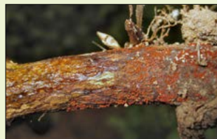
Red Crown Rot