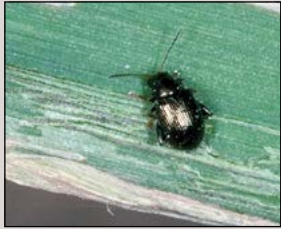
Corn Flea Beetle