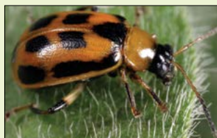
Bean Leaf Beetle

*Scouting information based on information from Pioneer, Iowa State University Extension, Purdue University Extension, University of Illinois Extension and the University of Kentucky Extension.