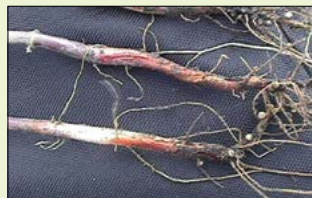
Rhizoctonia Root Rot