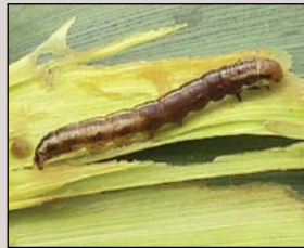
Common Stalk Borer