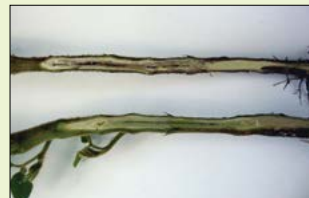
Phytophthora Root Rot