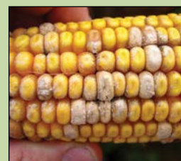
Fusarium Ear Rot