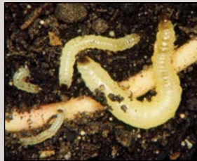
Corn Rootworm Larvae