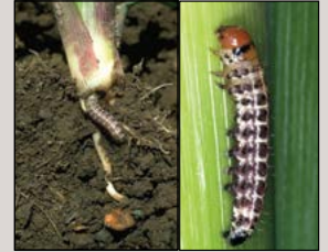
Hop Vine Borer