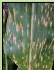
Gray Leaf Spot