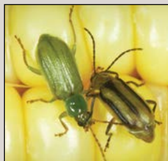
Corn Rootworm Adults