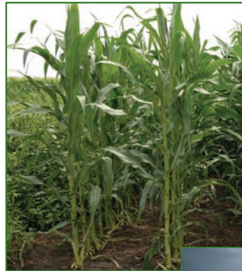
Pioneer® brand corn hybrids with the Optimum® GAT® trait treated with a unique DuPont Crop Protection preemergence herbicide (untreated check on left).