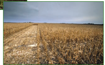
Noticeably cleaner fields through harvest. (Optimum® GAT® Corn, Mankato, Minn.)