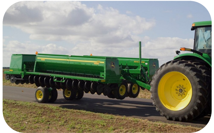
John Deere 455 box drill ready for fall seeding of winter wheat.