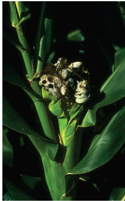
Figure 4. Mature common smut galls on the ear.