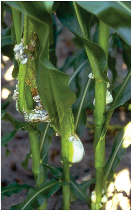
Figure 3. Common smut galls on corn stalks, likely finding an entryway through a wound on the corn plant.