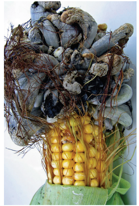
Figure 5. Galls on the ear tip. This differentiates common smut from the head smut disease, which does not allow any kernel development.