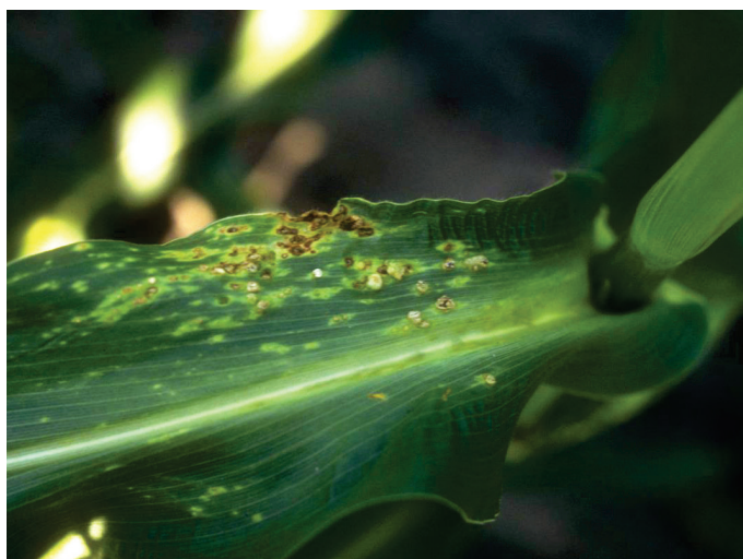
Figure 1. First indication of common smut as leaf infection. Small bumps occur when plants are infected at leaf whorl stage.

Ustilago maydis spores overwinter on corn debris or in the soil and retain viability for a number of years. It is assumed that most traditional corn growing areas in the world have common smut spores present in levels needed for infection if the conditions are favorable.