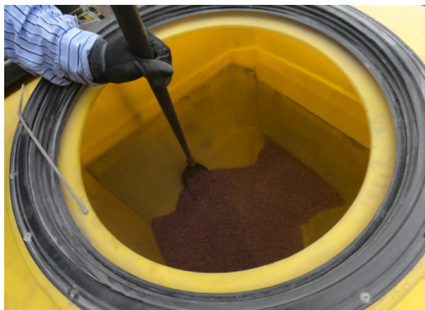
Image: Well-mixed treatment, mixing seed with scoop

When talc/graphite was poorly-mixed, percent singulation (skips and doubles) decreased, indicating a less accurate planting experience. However, when talc/graphite was well-mixed, percent singulation increased and no difference was observed between seed size or seed treatment. Large seed treated with the higher seed treatment load, when talc/graphite was well mixed delivered >98% singulation at 10 MPH and planting rate of 70k seeds per acre.