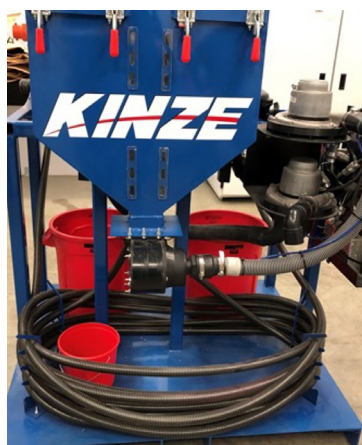
Image: This bulk fill test stand was developed by Kinze Manufacturing to replicate their air seed delivery system. The system includes a small, bulk fill chamber, entrainer, seed delivery tubing (length equivalent to a 24-row planter) and two individual vacuum meters.