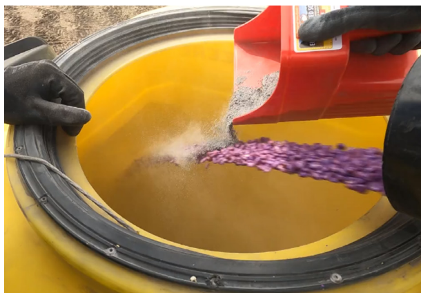
Image: Well-mixed treatment, adding planter aid to the hopper while seed is flowing.

For each test, seed treatment and seed size were the same with well-mixed planter aid in one center-fill bulk tank and partially mixed planter aid in the other bulk tank. The partially mixed planter aid treatment followed the suggested label rate also, but was not mixed with the seed. The well-applied planter aid followed the label by adding a scoop to the bottom of the hopper, then planter aid was added to seed flowing into the hopper and thoroughly mixed with a John Deere AA99640 Scoop throughout the fill.