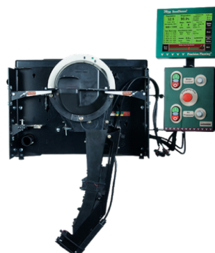
Image: planter singulation unit used in environmental growth chamber trial

Planting precision was measured by using a Precision Planting Meter Max test stand to quantify singulation, skips and doubles.