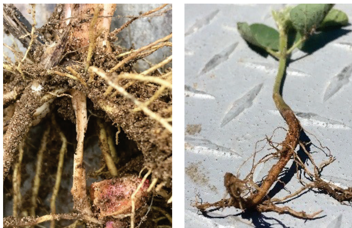
Figure 3. Root damage on corn and soybean seedlings caused by Asiatic garden beetle feeding in Indiana in 2018.