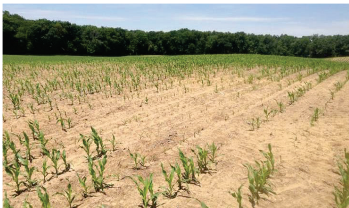
Figure 1. Asiatic garden beetle feeding may be scattered across a field, but the most severe damage is often concentrated in areas of intensive egg laying or better survival of larvae, commonly in sandy spots. Damage may be compounded by other factors affecting plant vigor.